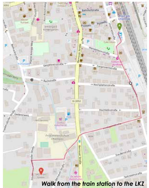
Walk from the train station to the LKZ