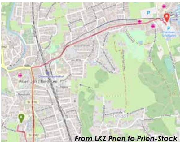
From LKZ Prien to Prien-Stock

Harbour Prien-Stock, Seestraße 108, 83209 Prien am Chiemsee