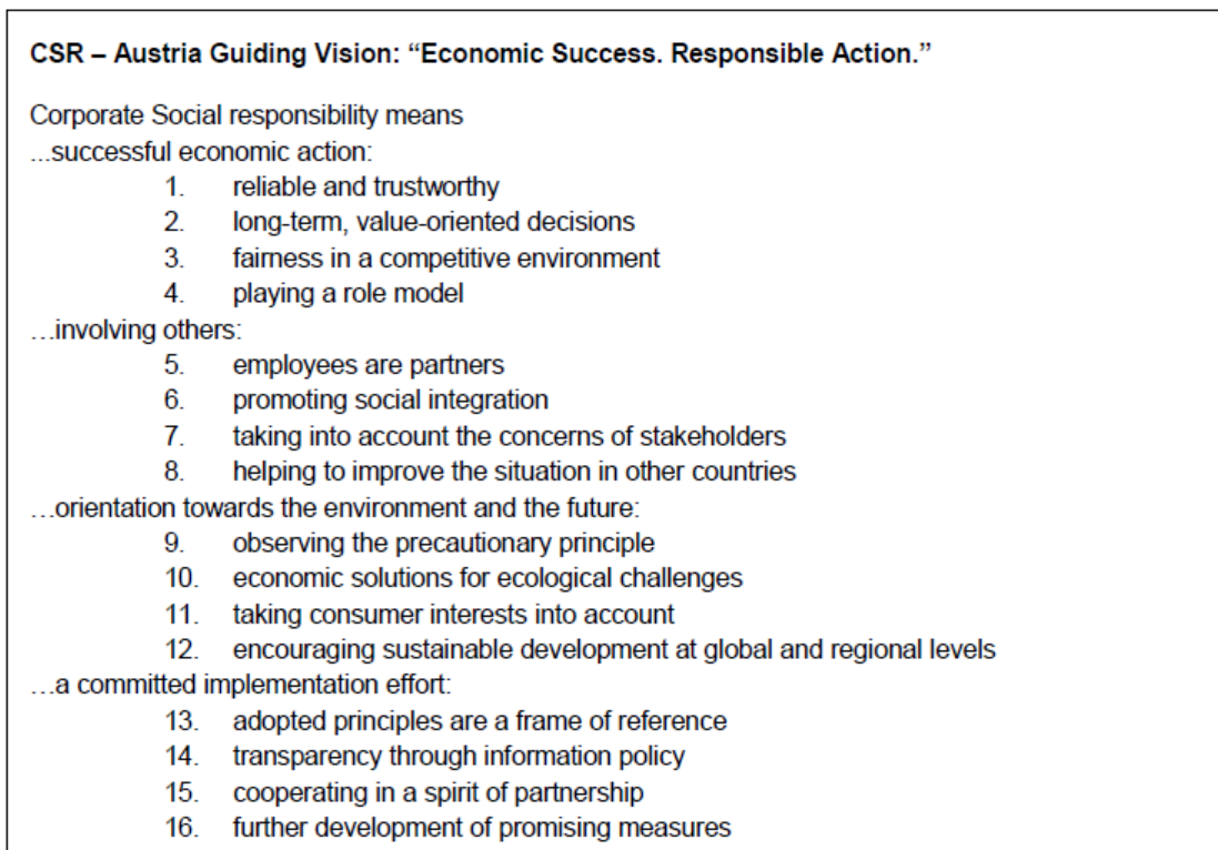
Diagram 2: CSR guiding vision: The 16 CSR principles of the Austrian Industry

and Austrian society at large. Following the Austrian tradition of social partnership the elaboration of the Guiding Visions involves a broad dialogue with representatives of all sectors of civil society. At the CSR-Conference end of September 2003 around 120 members from business, Non-Governmental-Organizations (NGOs), social partners, and international organizations discussed the first draft of the CSR Guiding Visions for the Austrian Business-Community. The finalized CSR-Guiding Vision “Economic Success. Responsible Action.” was presented in December 2003 in Vienna. The concept of responsible entrepreneurship stands for companies that exercise their activities in a manner to promote economic growth, to increase competitiveness and at the same moment to act environmentally sound and socially responsible. The developed 16 CSR principles of the Austrian Industry are listed in the next diagram.