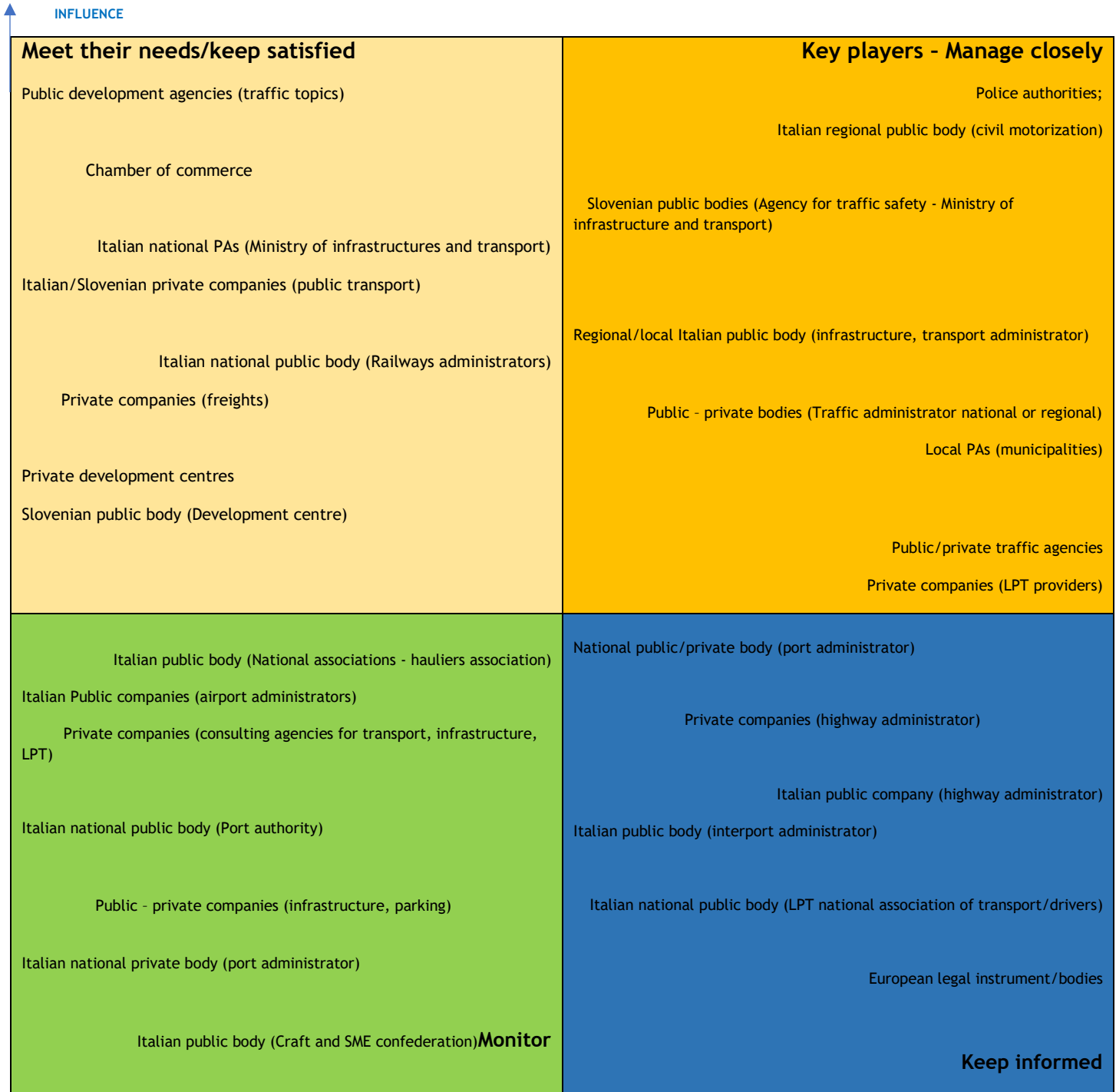
Figure 1: Stakeholder analysis and prioritisation for FORTIS project